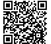
Family Growth Guide